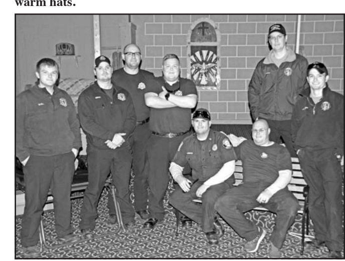
Firefighting crews from around the state and country have taken turns fighting the Tate City fire crisis. Here are men from fire departments out of the City of Covington, Walton County