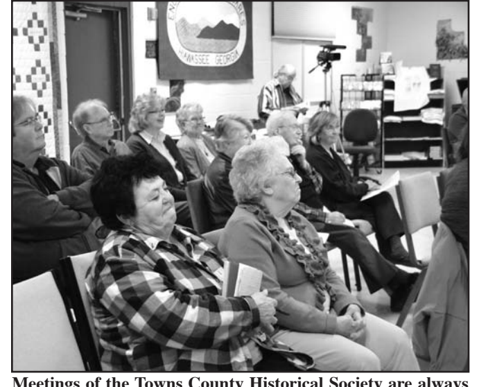
Meetings of the Towns County Historical Society are always well attended, and take place on the second Mondays of every month in the Old Rec Building.