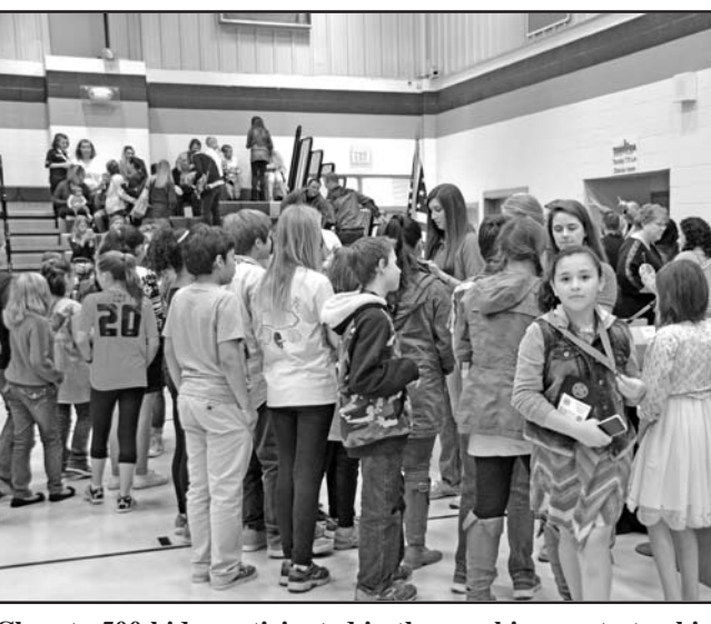
Close to 500 kids participated in the speaking contest, which took place at the Union County Middle School.

While a First, Second and Third Place winner was determined for each category, many areas had ties among the winners because of how well-developed the students' speeches were.