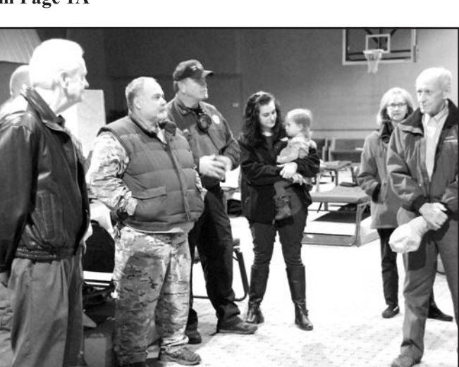
From the start of the local effort to contain the Rock Mountain Fire in Towns County, firefighters used the facilities at Mount Pleasant Church of God. Members of the community regularly brought supplies to the church, such as water, food, socks and